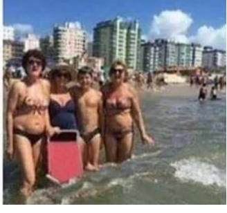
From our Gold Coast correspondent